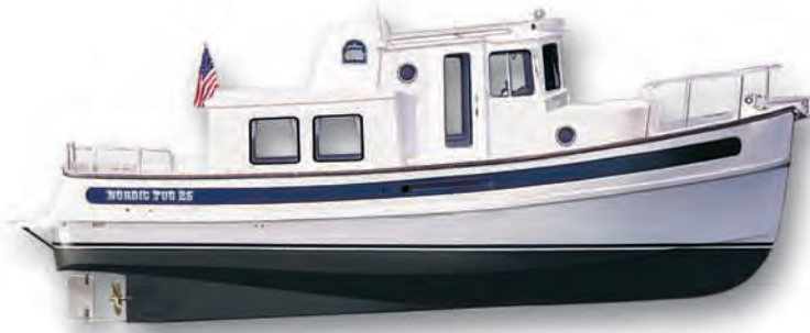
The Nordic Tug 26 Standard Model.